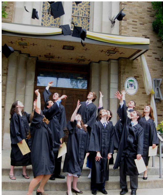
Commencement 2011, Eleven New Lyceum Alumni

An older friend convinced me we should go dancing that night at a bar and he knew how I could sneak in. While he entered the bar, I walked around to the back. I heard him whisper my name and, with a satchel containing a change of clothes, I climbed the back wall. I looked for him as I went over the top. Instead I saw a trash dumpster just before I fell into it. I had to scale another wall and climbed down onto a table where someone was sitting. I suppose it was he who reported