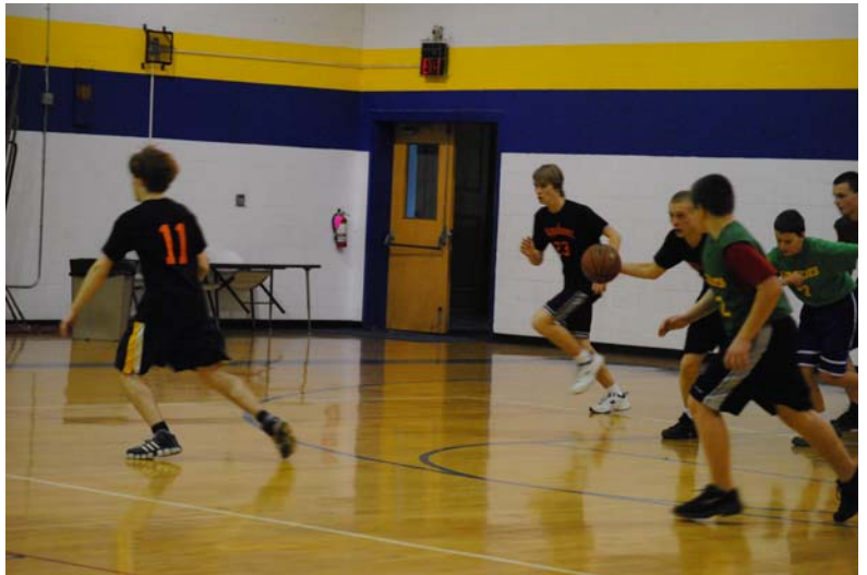
The boy's basketball team had a very strong performance in this inaugural year for the league!

These are not sensible pleasures and so they are not commonly